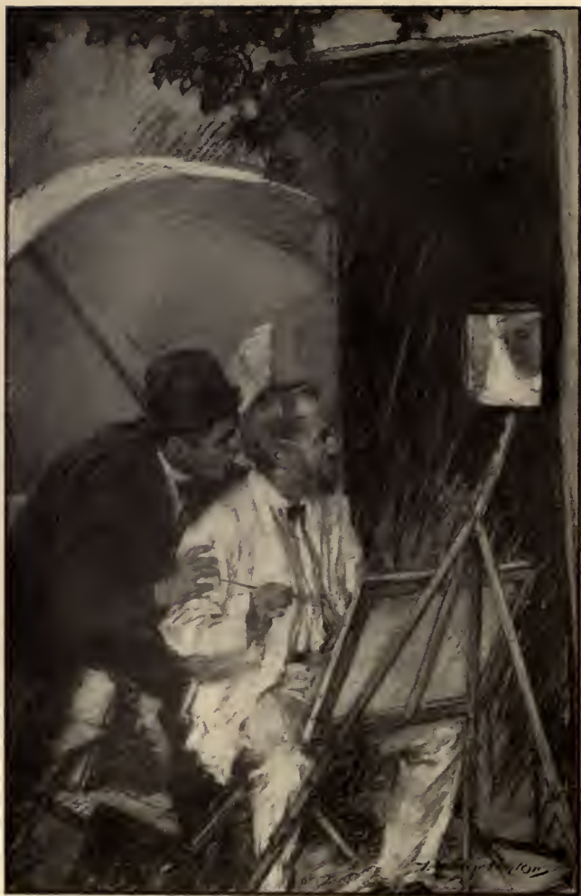
"Don't move and don't look," whispered Joe.